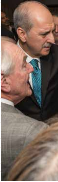
EXHIBITION IN LONDON WHERE LETTERS TRANSFORM INTO ART