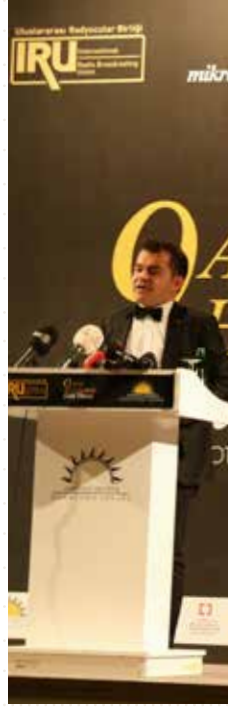
ANOTHER "COMMENDABLE" AWARD TO YUNUS EMRE ENSTİTÜSÜ...