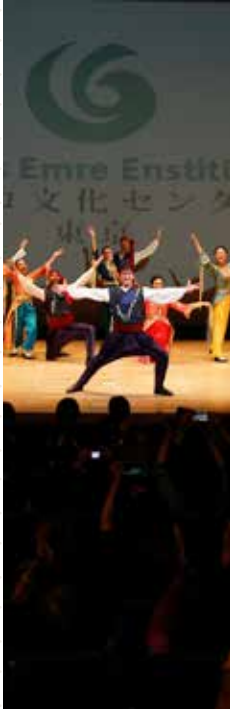
COLOURS OF ANATOLIA EXTENDED TO 5 CONTINENTS