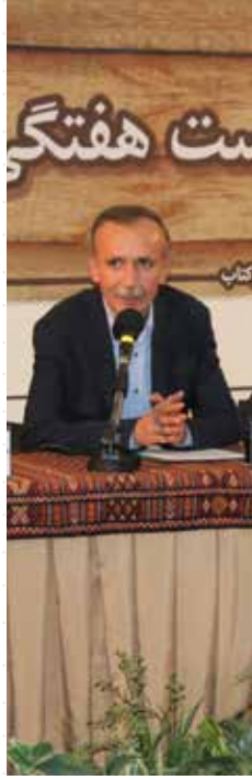
TURKISH POETRY BULL SESSION IN TEHRAN